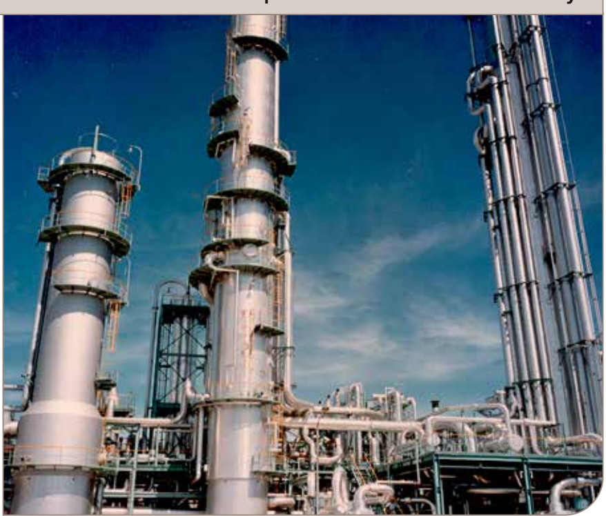
A Compabloc operates with a crossing temperature program and a temperature approach as low as 3°C (5.4°F). So significantly more energy is recovered than with shell-and-tube heat exchangers.

The company's engineers searched for a solution where fouling could be completely eliminated during cleaning, and efficiency maintained over time.