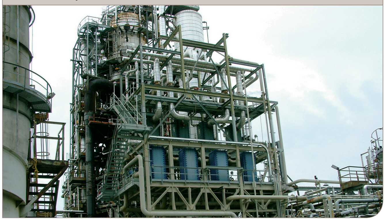
Energy savings were the reason for adopting Compablocs as condensers at the Shell refinery at Sarnia.

Shell is one of the largest integrated petroleum companies in Canada. To recover heat into boiler feedwater in order to offload the system, Shell replaced the shell-and-tube condensers at its refinery in Sarnia, Ontario with eight Alfa Laval Compabloc condensers. The new Compablocs are used as overhead condensers for overhead vapour stream from the main fractionator in the fluidized catalytic cracking unit (FCCU), where the main product is gasoline.